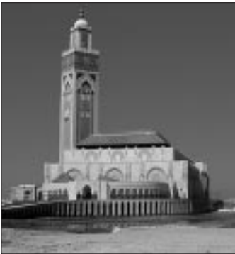
Hassan II Mosque - Casablanca