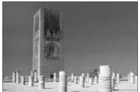
Hassan Tour - Rabat