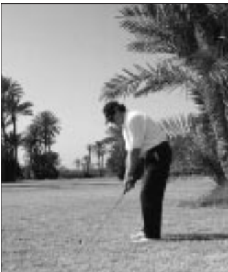
Royal Golf Club of Mohammedia