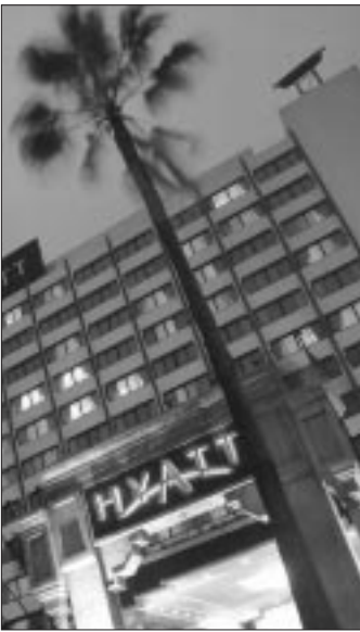
Hotel Hyatt Regency - Casablanca Conference and Exhibition