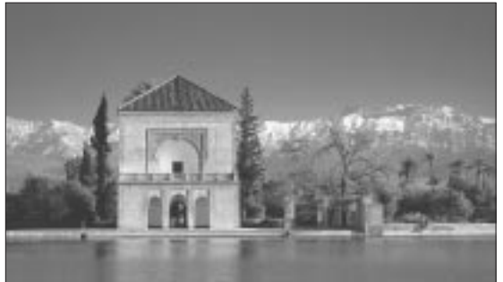
Menara Gardens - Marrakech