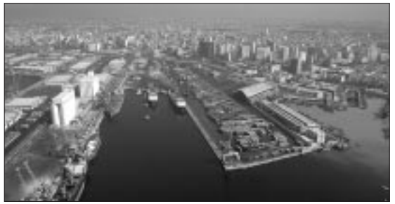
Port of Casablanca