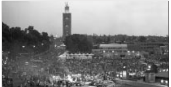
Square of Jamaâ El Fna - Marrakech