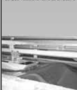
Restricted-Water Ship Towing Tank Marienwerder