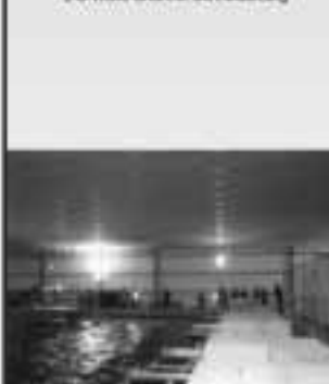
3-D Wave Basin Marienwerder