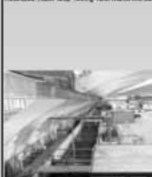
2-D Wave Channel Schneiderberg