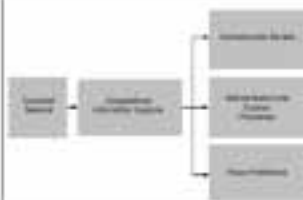
Computer Facilities for Numerical Simulations